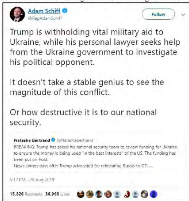
Figure 3: Chairman Schiff's August 28 tweet linking aid to investigations

Chairman Schiff's early awareness also explains why he pressured Inspector General Atkinson to produce the whistleblower's complaint to Congress, despite Acting DNI Maguire's determination that transmittal was not required because the complaint did not meet the legal definition of "urgent concern." 580